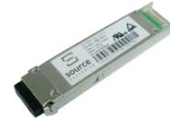
XFP 10G 1550nm 40km Transceiver