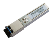
SFP SGMII 100M 40km C-ten Transceiver